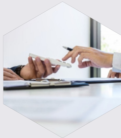
Liability Policy Claims