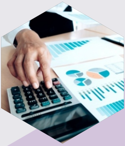
Banking & Financial