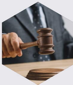
E-Auctioning Salvage Disposal