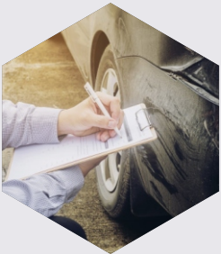
Marine Insurance Claims