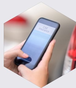
Extended Warranty Policy