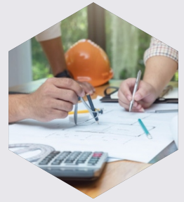
Commercial & Industrial Property